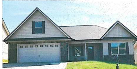
Dramatic Family Room

Lot #: 43* 1133 Pine Run Lane Model: Muirfield Hip $252,394 Construction Status: Under Construction * Photo is of a comparable home