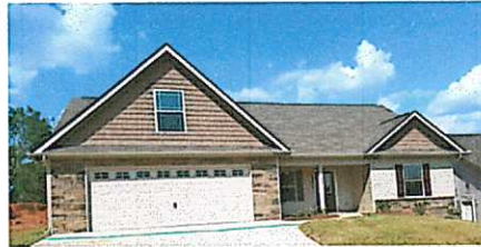
Dramatic Family Room

Lot #: 50* 11723 Highland Run Ln Model: Muirfield $239,082 Construction Status: Ready to Move In