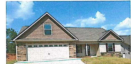
Dramatic Family Room

Lot #: 53* 11711 Highland Run Ln. Model: Muirfield $258,259 Construction Status: Under Construction * Photo is of a comparable home