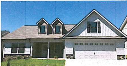
Dramatic Family Room

Lot #: 39* 1113 Pine Run Lane Model: Vintage Muirfield $262,959 Construction Status: Under Construction * Photo is of a comparable home