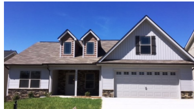
Dramatic Family Room

Lot #: 39* 1113 Pine Run Lane Model: Vintage Muirfield $262,959 Construction Status: Under Construction