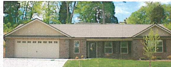
Dramatic Family Room

Lot #: 81* 6307 Altacrest Ln. Model: Ultimate Chadwick $241,609