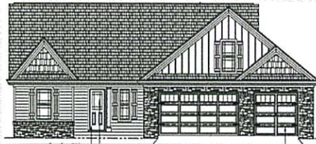
Dramatic Family Room

Lot #: 91* 6338 Altacrest Ln. Model: Muirfield $287,029