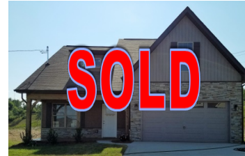
Vaulted Family Room

Lot #: 55 1165 Blackstone View Ln. Model: Westin $291,413 Construction Status: Ready to Move In