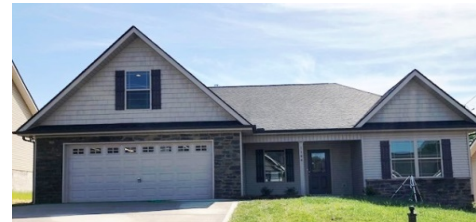
Dramatic Family Room

Lot #: 43* 1133 Pine Run Lane Model: Muirfield Hip $252,394 Construction Status: Under Construction