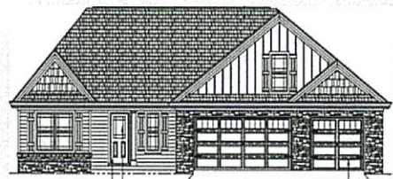
Dramatic Family Room

Lot #: 100* 2432 Maitland View Ln. Model: Muirfield Hip $278,129