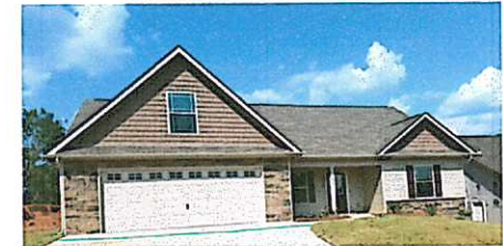
Dramatic Family Room

Lot #: 53* 11711 Highland Run Ln. Model: Muirfield $260,259