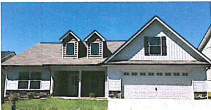
Dramatic Family Room

Lot #: 39* 1113 Pine Run Lane Model: Vintage Muirfield $264,959