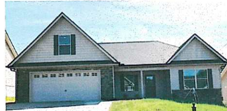
Dramatic Family Room

Lot #: 43* 1133 Pine Run Lane Model: Muirfield Hip $254,394