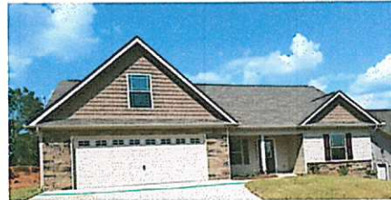
Dramatic Family Room

Lot #: 50* 11723 Highland Run Ln Model: Muirfield $241,082