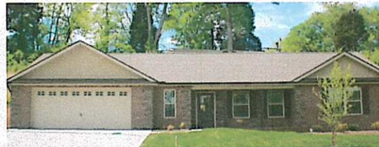
Dramatic Family Room

Lot #: 81* 6307 Altacrest Ln. Model: Ultimate Chadwick $243,609