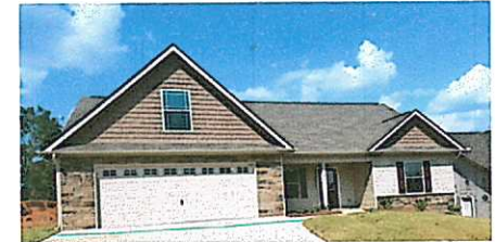
Dramatic Family Room

Lot #: 47* 11735 Highland Run Ln. Model: Muirfield $254,459