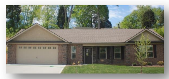
Dramatic Family Room