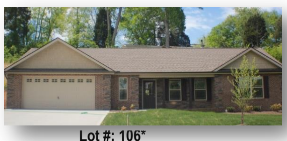
Dramatic Family Room